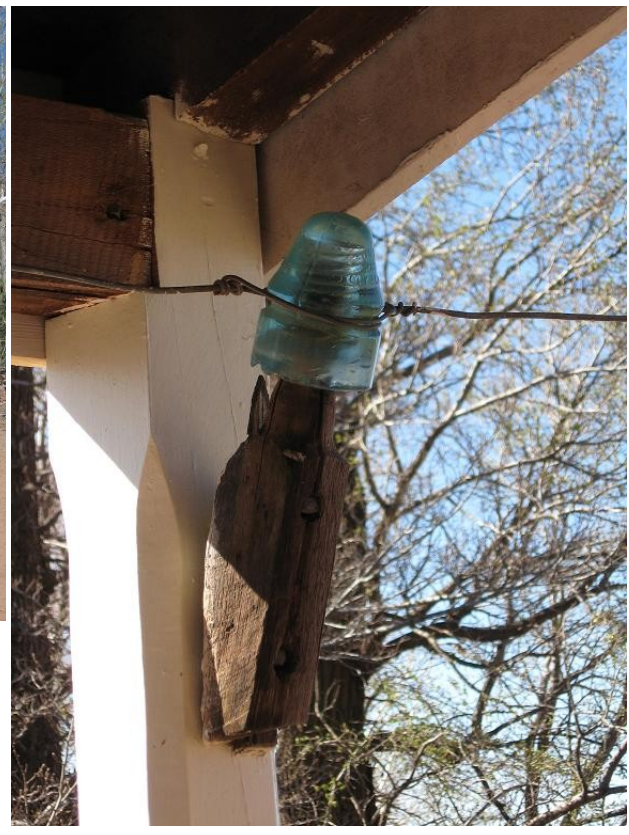
CD133 [230] Used on the Original Deseret Telegraph Line