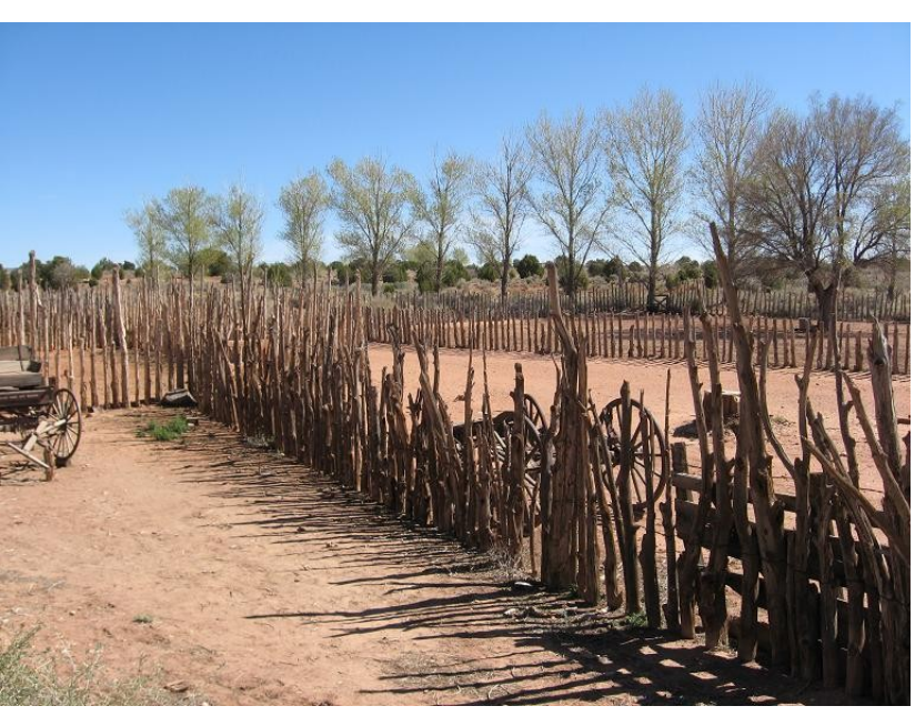
Vertical Pole Corral Fence