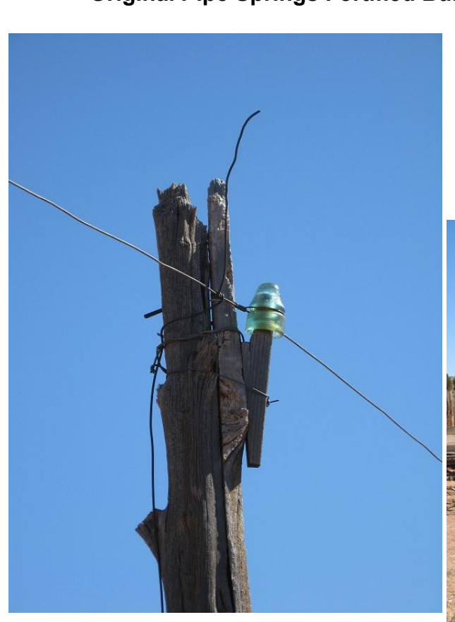
Old Pole Replica with Grounding of the Conductor to Arrest Lightning